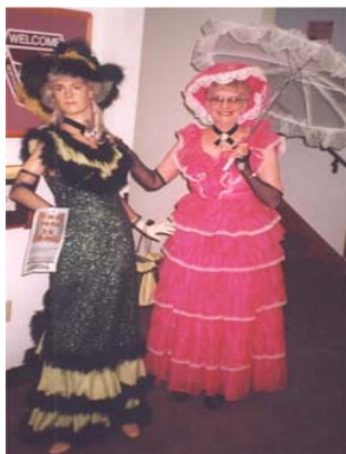
Socials and Events!