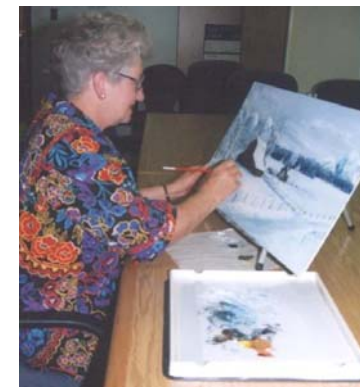
Crafts & Hobbies!