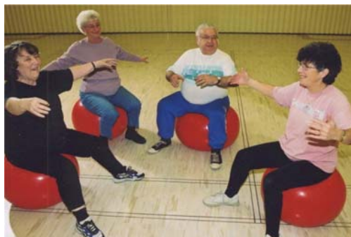
Fitness & Sports!