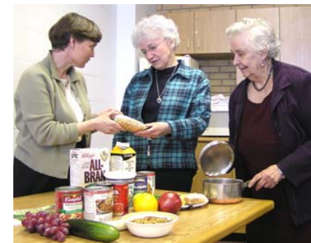
Health and Wellness!